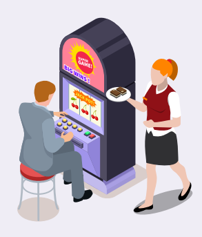
4. Order is delivered directly to the player at the EGM, all while they continue to play.