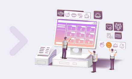
2. Order is then sent to Service Call, containing EGM location.